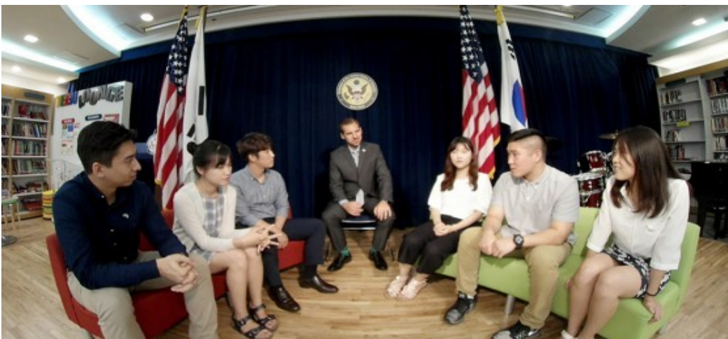
Students discuss at the American Center Korea, US Embassy Seoul

The Asia Society Korea Center hopes to convene leaders from the public and private sectors to address relevant issues before an audience that includes Asia Society contributors and members, as well as leaders from Korea's corporate, cultural, media and civic sectors. We look to introduce innovative programming concepts that serve to foster open debate and civil discourse on various issues as well as social responsibilities in Korean society.